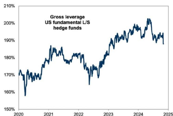
Exhibit 5: HF gross leverage declined ahead of the election